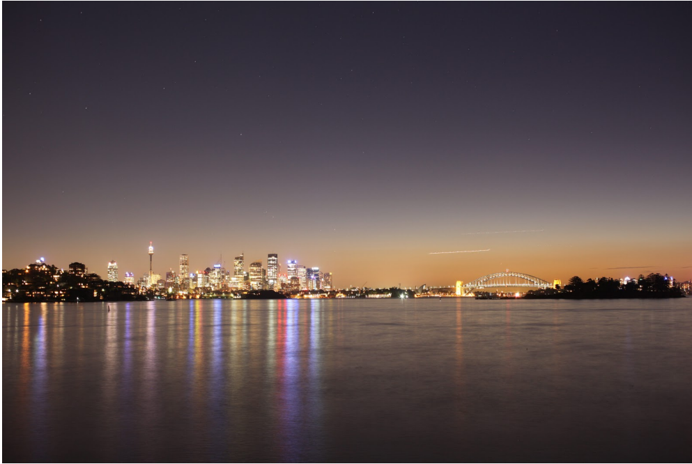
Figure 1: One possible developed version of the RAW image provided with the assignment.

Scaling with darkness <black>, saturation <white>, and multipliers <r_scale> <g_scale> <b_scale> <g_scale>