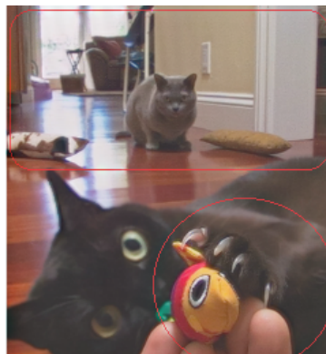
Figure 2: Multifocus image enhanced by using laplacian pyramid