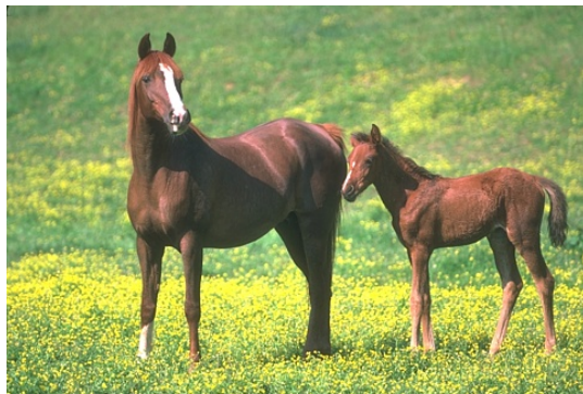
a) Input Image

Due Date: 23:59pm on Monday, January 6th, 2014