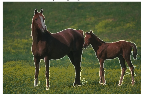
d) Image Segments