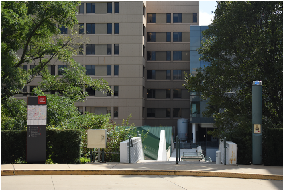
Figure 1: One possible developed version of the RAW image provided with the assignment.

Scaling with darkness <black>, saturation <white>, and multipliers <r_scale> <g_scale> <b_scale> <g_scale>