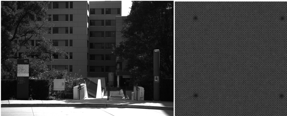
Figure 3: Left: The linear RAW image (brightness increased by 5). Right: Crop showing the Bayer pattern.