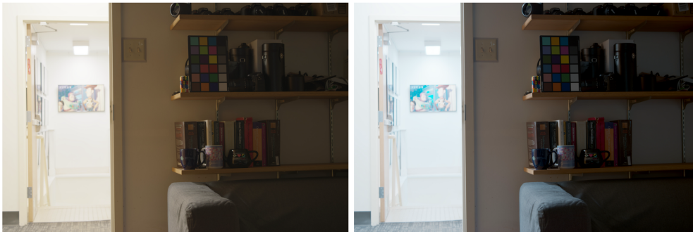
Figure 2: Tonemapped HDR image without (left) and with (right) color correction.

For this part, you will use the HDR image you selected at the end of Part 1. As shown to the left of Figure 2, your tonemapped images will tend to have an orange cast in the dark parts of the room. This is because the very low light inside the room and the large contrast with the light outside the room are throwing the camera’s automatic white balancing off. Additionally, even if the white balancing worked perfectly, we have not been very careful about the color space the various image composites reside in.